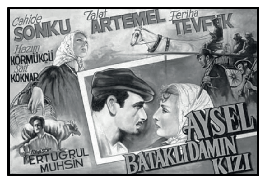
Visual-1: Aysel Bataklı Damın Kızı Film Poster - Published with permission from BİSAV TSA Archive.

Source: Online- https://www.tsa.org.tr/tr/film/filmgoster/5372/aysel-batakli-damin-kizi Access Date: 23.03.2021