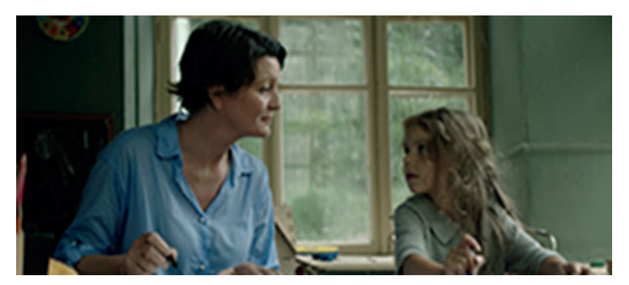
Image 5: Halla with the girl

Halla is a very powerful character and she carries out a critical struggle against the officials and she also wants to adopt a child. After years, she is informed that the outcome of her adoption application is positive. Halla and the girl can be seen in Image 5 .